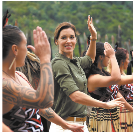
CLOCKWISE FROM TOP LEFT: Waitangi Treaty Grounds, NZ's most important historic site; cruise through the beautiful Bay of Islands to Piersy Island, or as it's popularly known, the Hole in the Rock; you will be immersed in the traditions and customs of Māori culture in Rotorua; enjoy panoramic viewing on the 32 seat Signature Coach.