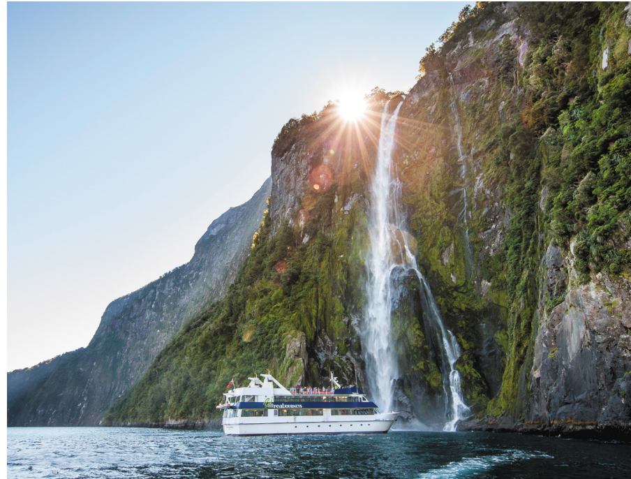
A tour highlight is a cruise and lunch on the magnificent Milford Sound.